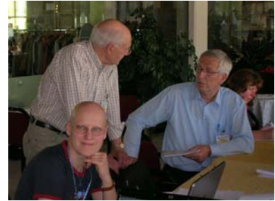
Interval for all delegates during the section meeting.

All countries will be asked for possible documentation for the judges' training course. The trainee judges will be trained in three stages (C.B.A.); namely: C-Judge is a judge that has successfully absolved one category of the European standard (Smooth Coated, Rough Coated, Long Coated); B-Judge is a judge that has successfully absolved two categories of the European standard and A-Judges are fully qualified. Trainee judges can attend the seminars in March as well as all shows where an EE approved judge is officiating (the trainee judge could possibly take his oral and practical exams at such a show).