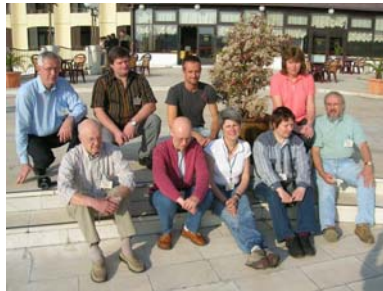
The 9 delegates on the terrace of the conference hotel

This year the meeting was attended by 9 delegates from 9 countries, whilst 3 countries had apologised for their absence.